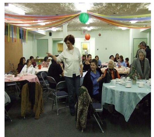
3 O'clock Tea and Cake Senior's Cultural Event at The New Life Centre. February 2007