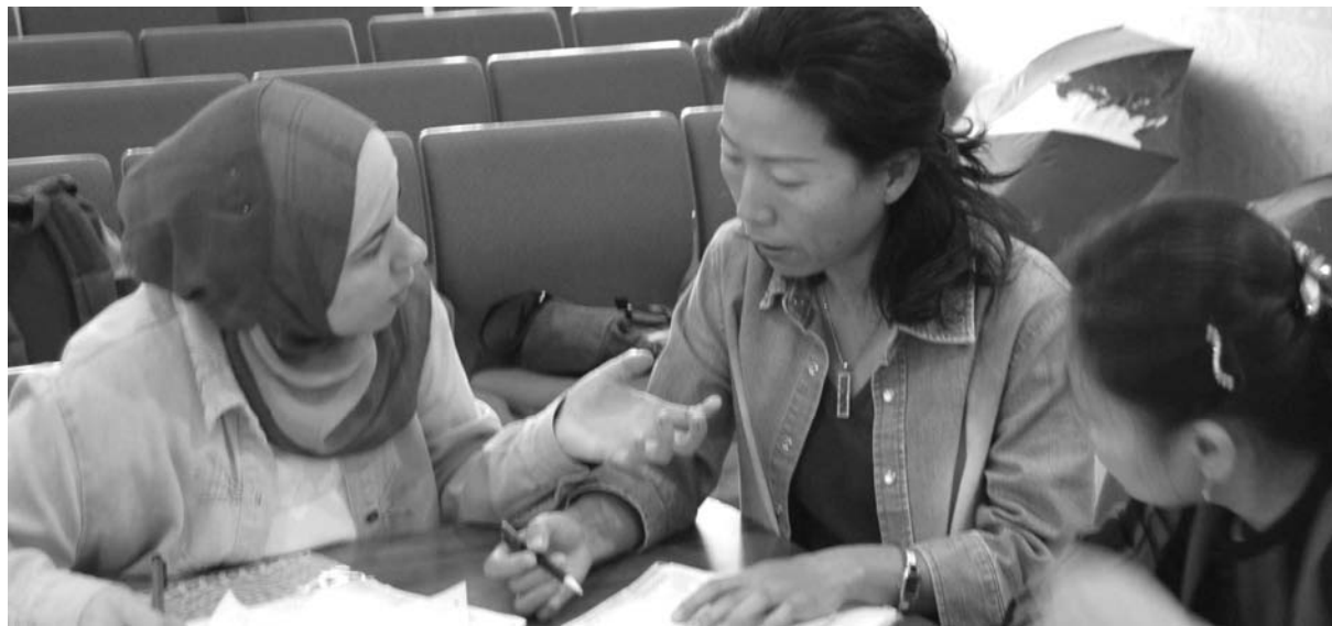
Students practice English and share experiences in the advanced class at the New Life Centre.

This school has a good environment and kind people. The most important thing is we have good teachers. They help us with many challenges. They help us develop our skills so we can connect to professional jobs. This school is especially good for newcomers who have some problems because they can discuss them here.